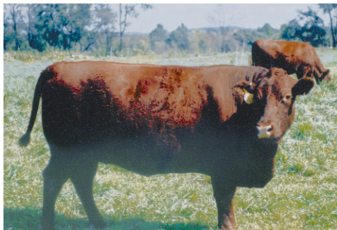
PHOTOGRAPH OF 44