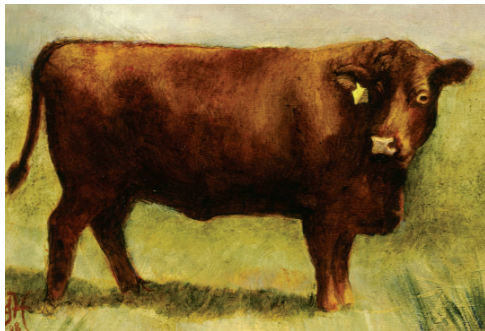
PAINTING OF 44